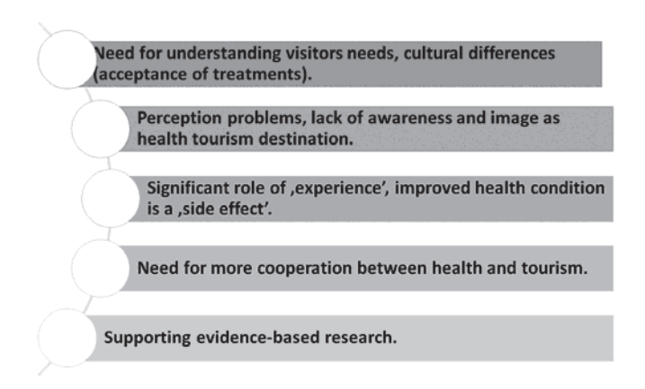
Figure 3: Off to Spas project conclusions